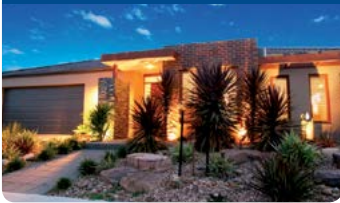
Home & Contents – Gold Star